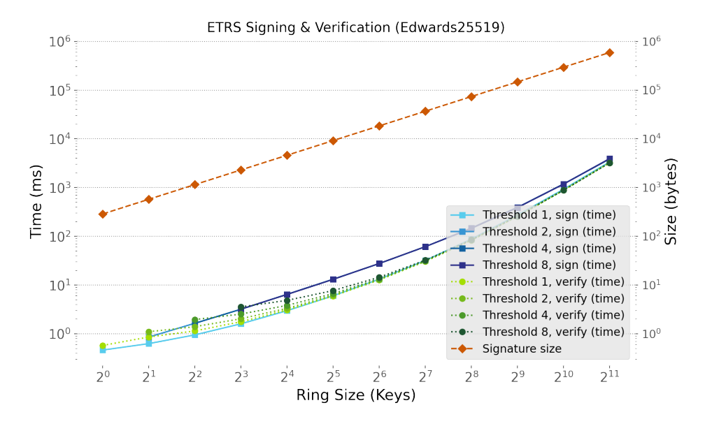
Fig. 14: Clock time and signature sizes for our ETRS scheme (Figure 12), for different thresholds. The signature generation time includes the initial signature generation and subsequent extensions. The signature size is independent of the threshold.

ERS Benchmark We benchmark our ERS implementation for ring sizes of 1 to 2<sup>11</sup> on an Intel Core i7-6700K Skylake running at 4 Ghz, with HyperThreading and TurboBoost disabled. The signature generation time, verification times and signature sizes (without point compression) are shown in Figures 13